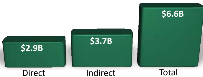
Projected Economic Impact (in billions)

It is projected that the expansion of UAB by FY 19-20 will have a significant impact on state and local government revenues. Utilizing a mid-range growth scenario, it is projected that state and local government revenues attributable to the presence of an expanded UAB will total $431.4 million (direct and indirect).