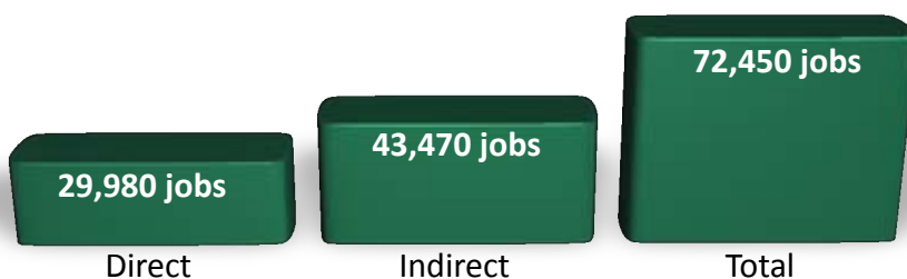
Projected Employment Impact (in jobs)

UAB's projected growth will have an even stronger impact on the state. Utilizing a mid-range growth scenario, it is projected that a total of 72,450 jobs will be created and sustained by UAB by FY 19-20 — an increase of over 11,000 jobs.